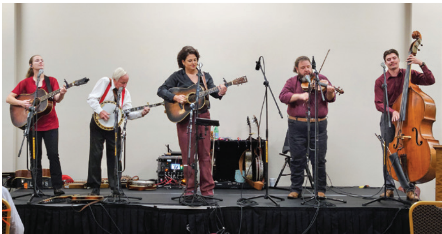
The Little Roy and Lizzy Show of Lincolnton entertained the guests with bluegrass gospel music before the meeting.